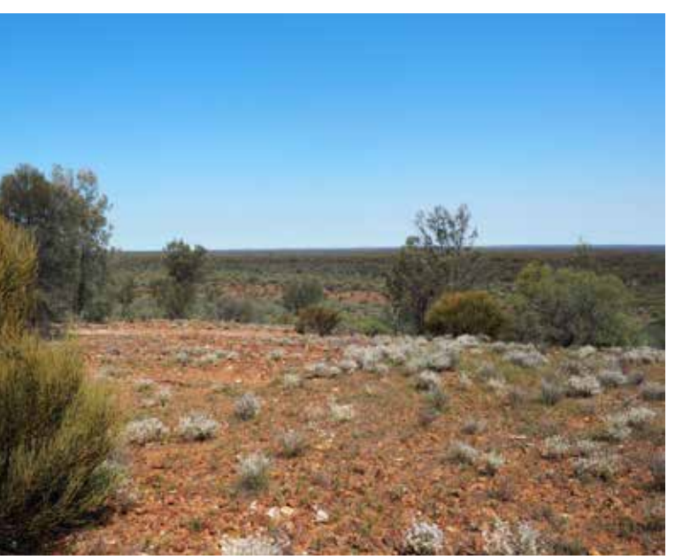
Ardea boasts a total landholding of more than 4,200sq km in the Eastern Goldfields

"HPAL technology has been around since the 1960s with Moa Bay in Cuba. That was generation one, we're now up to the fifth generation of the technology. You've got huge companies like Sumitomo who developed Coral Bay in the Philippines, ramping up both of their autoclaves in under 12 months. We've seen recent HPAL developments in Indonesia, reportedly ramping up to nameplate capacity within 3-4 months, which is just outstanding and demonstrates